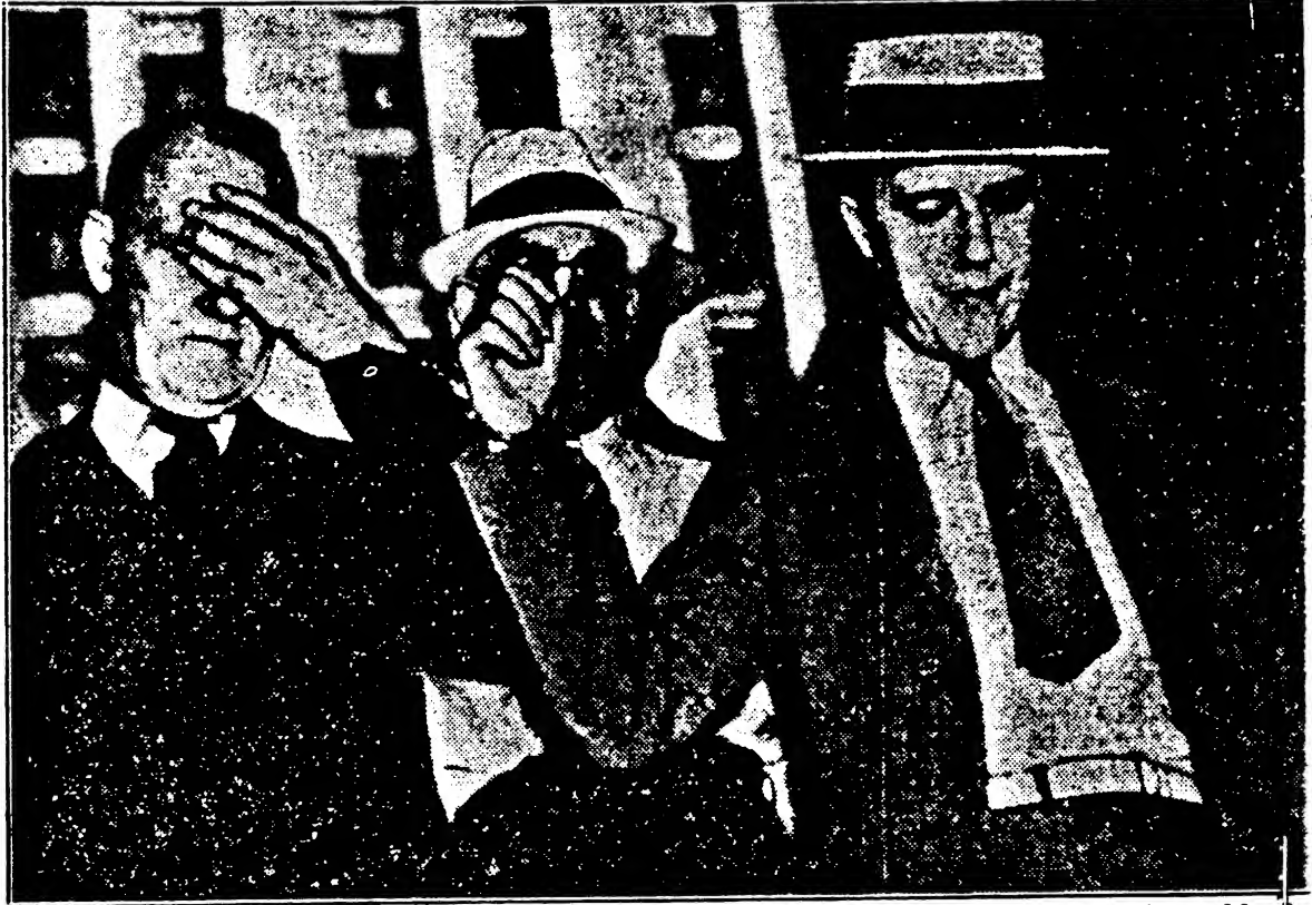
Alvin Karpis, at the right, involuntarily shot his hand in the air as Charles Fitzgerald, at left, handcuffed to him, tried to hide his face from the camera yesterday after they were sentenced to life imprisonment at St. Paul, Minn., for the $100,000 kidnaping of William Hamm, wealthy brewer.